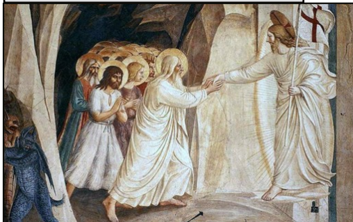
Fra Angelico's Raising of Hell a.k.a. The Harrowing of Hell, or Christ in Limbo, is one of the frescoes painted by Fra Angelico (and his assistants) between 1437-1446 for the monastery of San Marco in Florence, located in one of the monks' cells. (Painting is in the public domain)