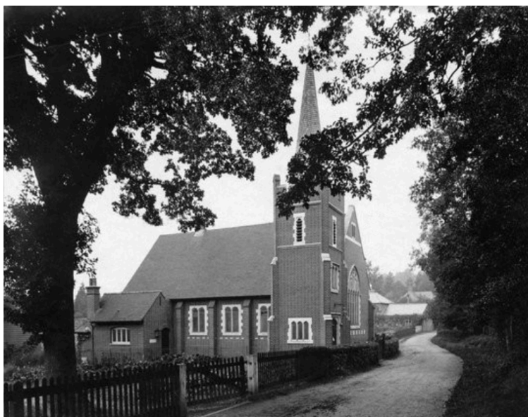
Sandhurst Methodist Church, Scotland Hill, 1909